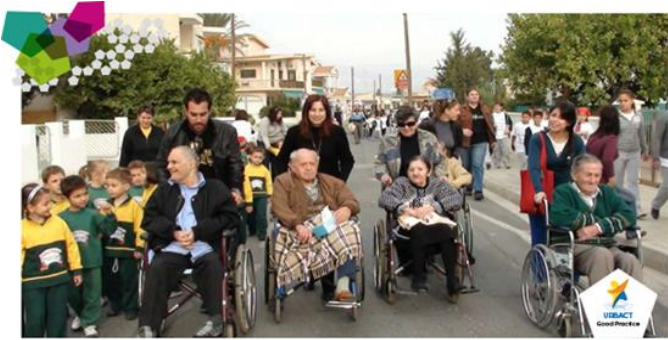
Picture 2 SUNDAY WALK - VOLUNTEERING ACTIVITY OF ALL GENERATIONS